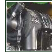
Dry Type Air Filter

Modern, technologically advanced, powerful John Deere 3029D engine