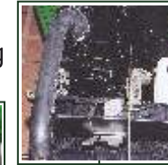
Radiator with Overflow Reservoir